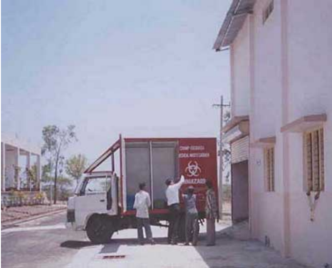
Biomedical Collection vehicle of CHAMP CTF, Gulbarga